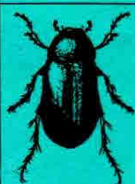
generic, not pine bark, beetle

I have used this method for several years with complete success.