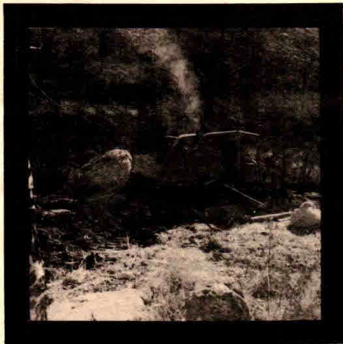
Repairing the damage.

The RLA Board urges you to participate in your association by volunteering for committee work. Help is needed on the following committees: Beetle control, landscape maintenance, road maintenance, newsletter, Architectural control;