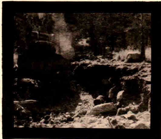
A river? No, just a landowners drive way after the 10" of runoff.

We took walks both ways, toward Drake and then toward Glen Haven. It is simply impossible to describe the devastation caused by the rushing water. Nothing was left in places where there had been cabins, not even foundations.