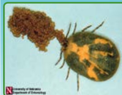
Above: American dog tick laying eggs. University of Nebraska Cooperative Extension in Lancaster County

Centers for Disease Control and Prevention: www.cdc.gov