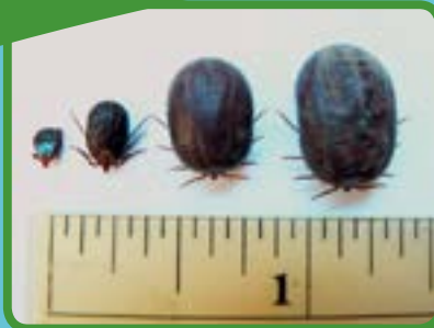
Left: Stages of tick engorgement