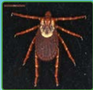
Above: Female Rocky Mountain wood tick

Ticks are arachnids (related to spiders) that feed on the blood of animals. They are found throughout Colorado, commonly at higher elevations and can occur from early spring to late fall, but are less common during the hottest summer months. Rocky Mountain wood tick ( Dermacentor andersoni ) and American dog tick ( Dermacentor variabilis ) are the most common ticks associated with people in the state. These ticks are usually found on grasses and low plants, waiting to attach to a host. They don't fall from trees, jump or fly! Some 30 species of ticks occur in Colorado. Ticks are important because pathogens (bacteria, viruses or protozoa) can be transmitted when infected ticks feed on humans.