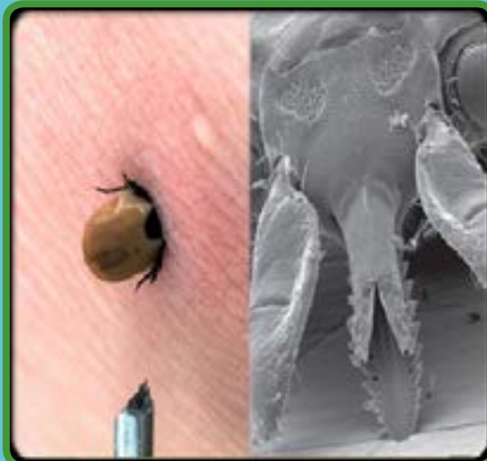
Above: Illustration of American dog tick bite. (© 2009 WebMD, LLC. )