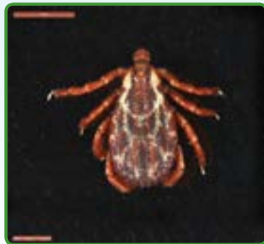
Above: Male Rocky Mountain wood tick

The other two tick-transmitted diseases -- Rocky Mountain spotted fever (caused by the bacteria Rickettsia rickettsia ) and tularemia (caused by the bacteria Francisella tularensis ) -- are not common in the state.