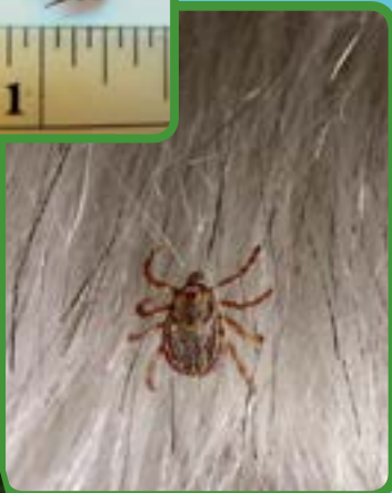
Right: American dog tick attaching to dog hair.