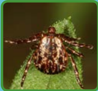
Above: Close-up view of American dog tick (© 2006 Tom Murray)